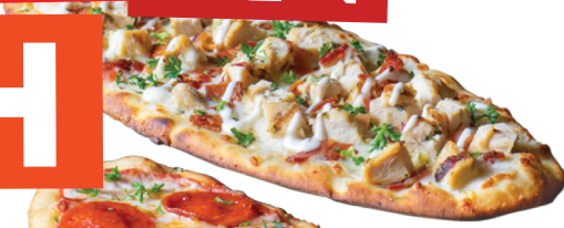
Chicken Bacon Ranch Flatbread

Diced chicken and bacon topped with ranch dressing. 850 cal