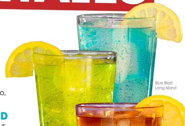
Blue Blast Long Island